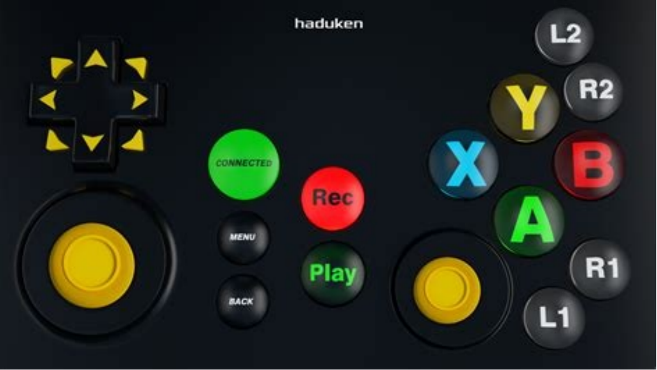
Using gamepad on android. Games to play with gamepad on android.