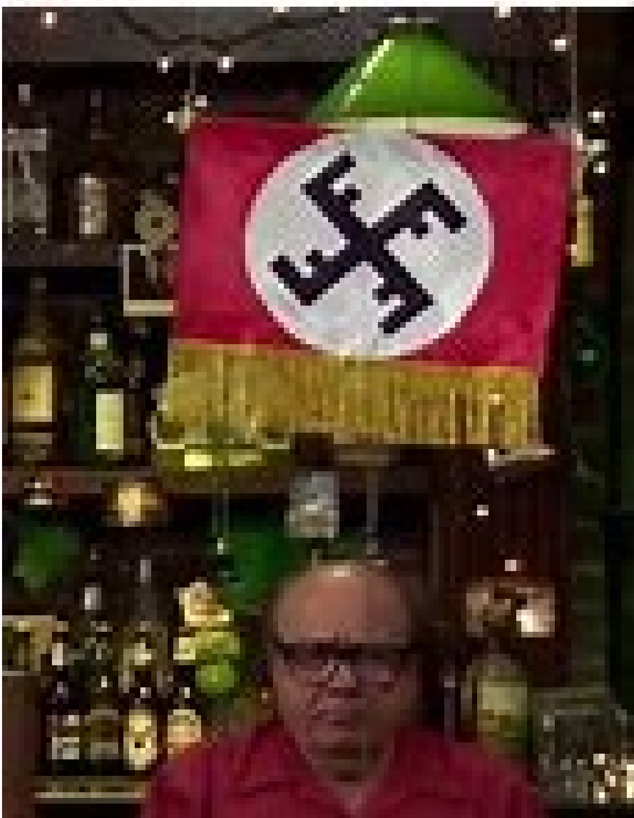
R danny bot commands.

:Danny DeVito: hey Hitler can I borrow your Holocaust? : Adolf Hitler: yeah sure just make it look like your own work :Danny DeVito: