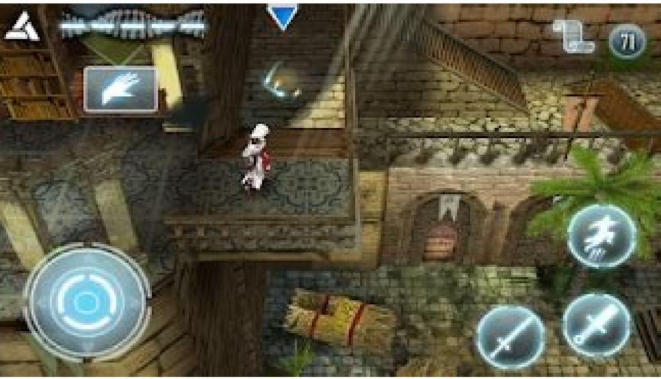
Assassin creed altaïr chronicles apk download 1280x720.