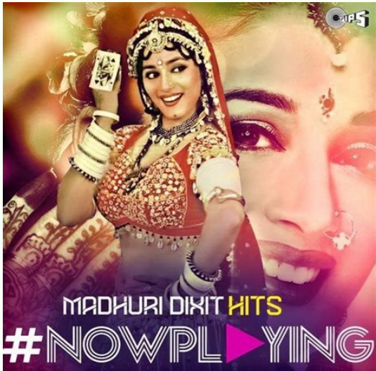
Chote raja hd video song download pagalworld. Chote raja video song download hd.