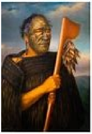
Tamati Waka Nene Oil