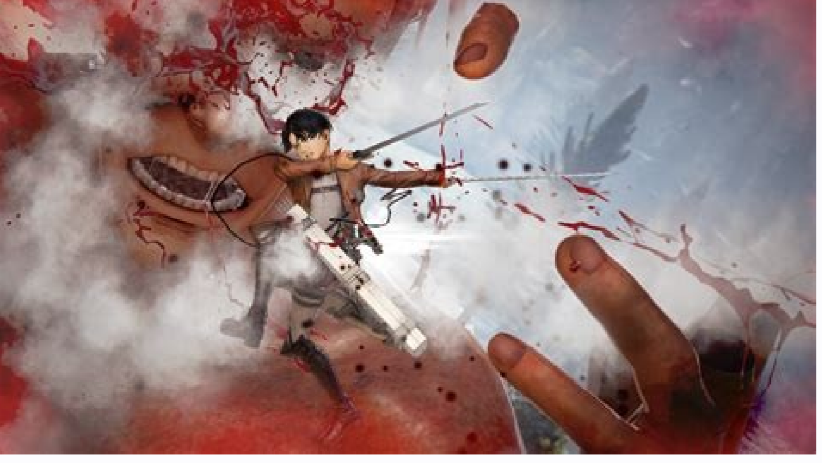
World most popular offline game. World no 1 offline game.