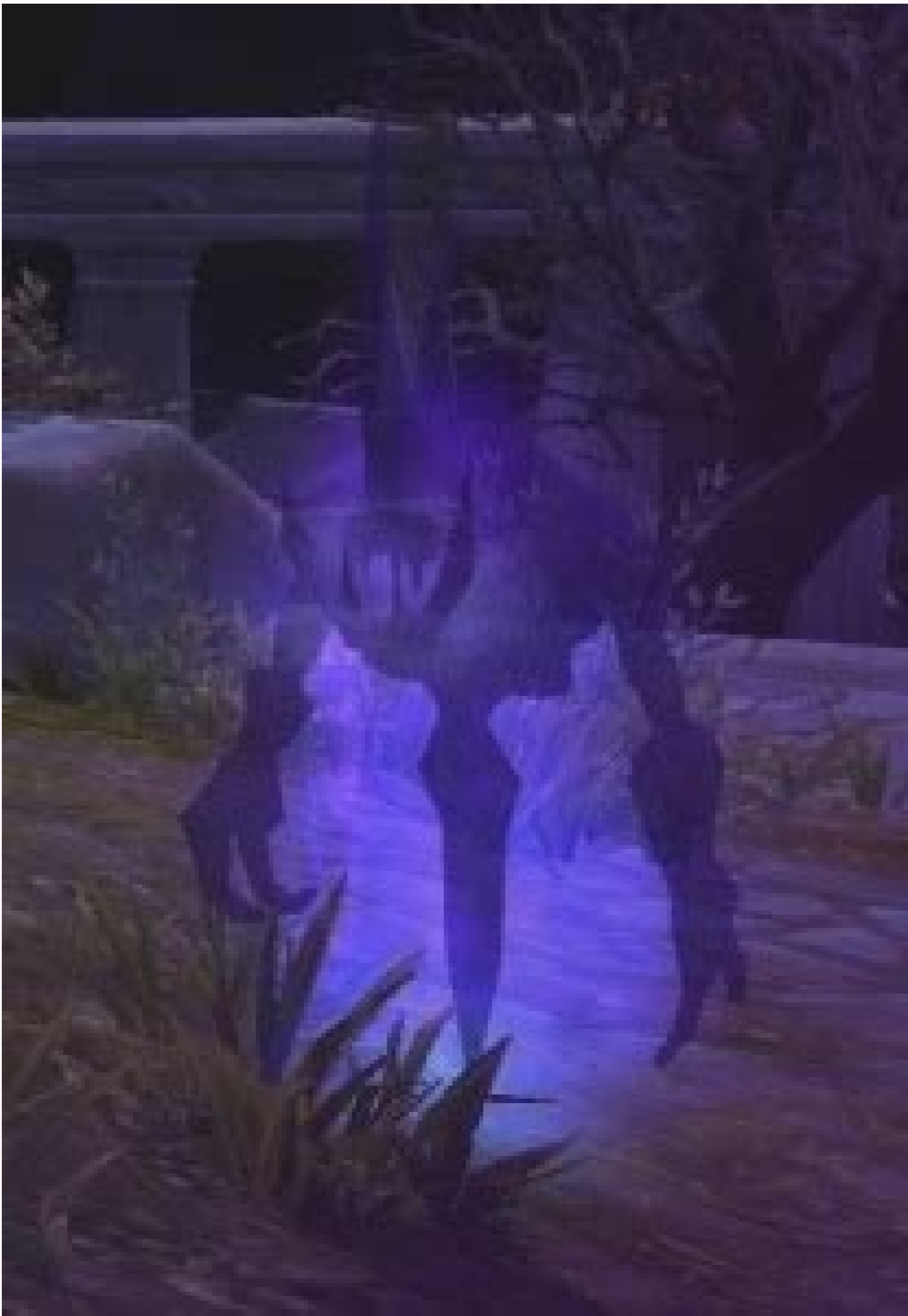
Hearthstone big priest. Hearthstone big priest wild.