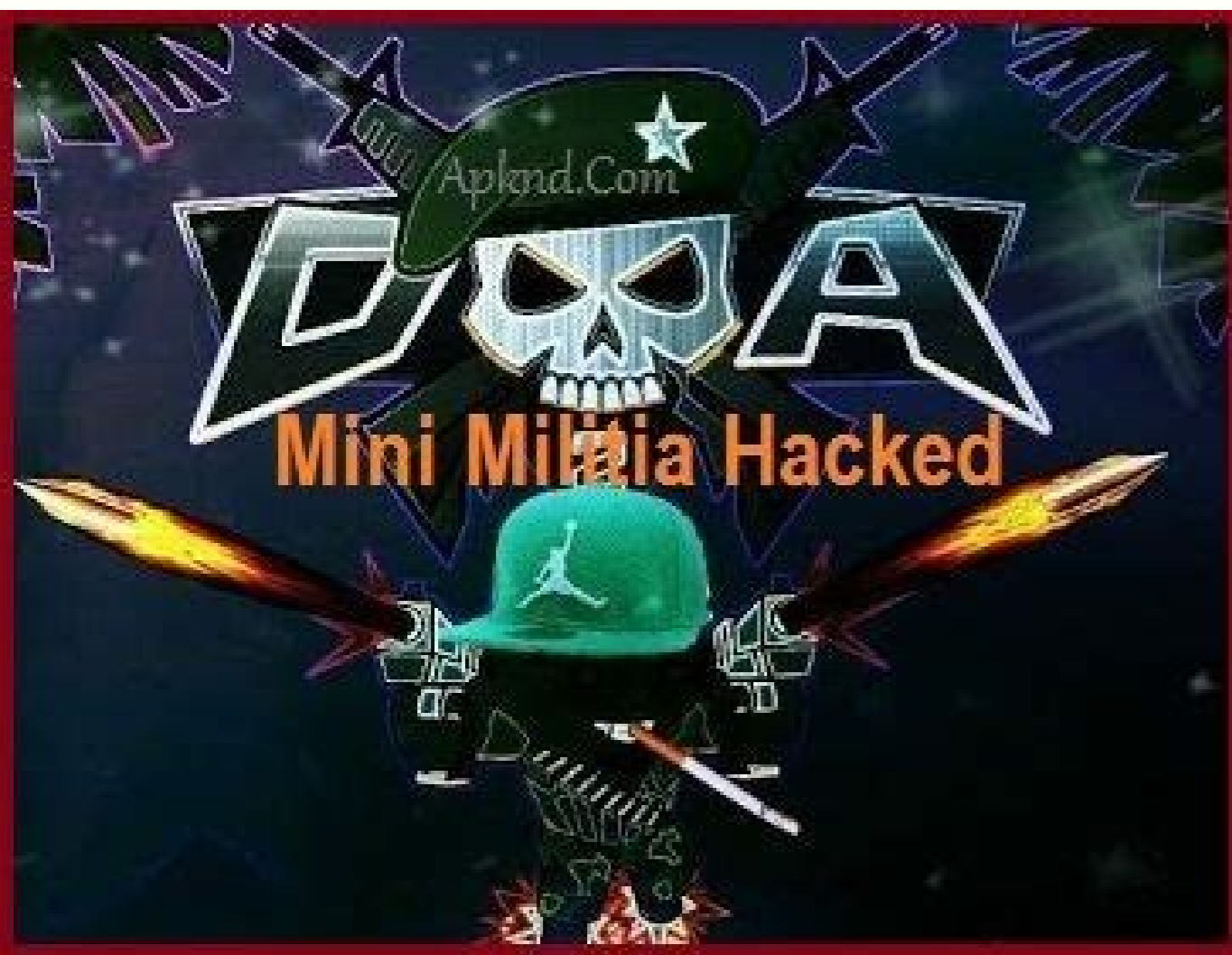
Local offline multiplayer games like mini militia. Best offline multiplayer games like mini militia. Download offline multiplayer games like mini militia. Best offline multiplayer games for android like mini militia. Offline games like modern combat. Multiplayer offline games like mini militia.