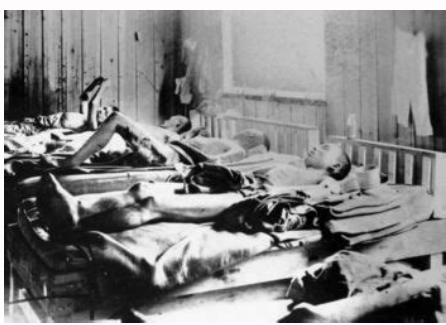
What leads to Hiroshima and Nagasaki. Short term effects of Hiroshima and Nagasaki. Causes of Hiroshima and Nagasaki. Causes of Hiroshima and Nagasaki bombing.